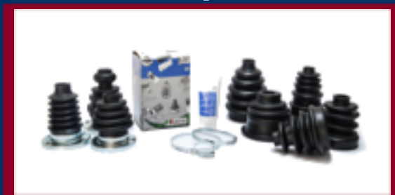
Cv-Boots as bulk and kits