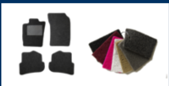
MAT+®, Car mats and mats for multiple purposes

The range of products offered by Huntsman Gomet, available as both loose items and kits, covers all European and most Asian automotive applications.