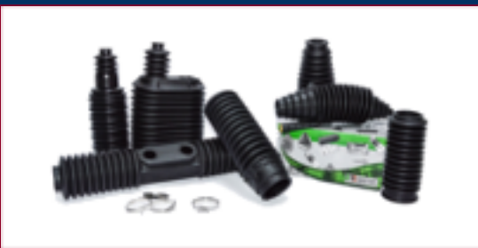
Steering gaiters as bulk and kits