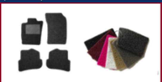
MAT+®, Car mats and mats for multiple purposes