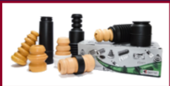
Dust covers, Bounce bumpers and Shock Absorber Service Kits ("SASK")