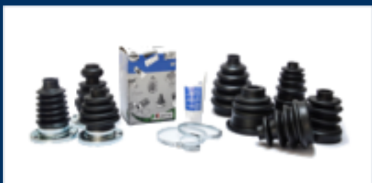
Cv-Boots as bulk and kits