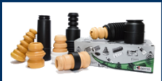
Dust covers, Bounce bumpers and Shock Absorber Service Kits ("SASK")