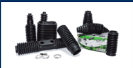
Steering gaiters as bulk and kits